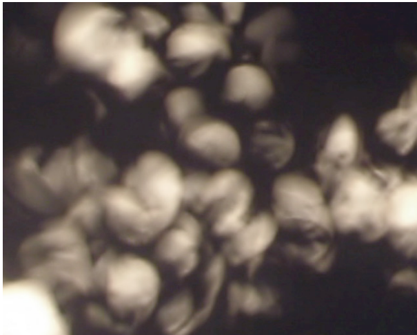
Figure 1. Screenshot from Overlooked

two second video piece that plays with the dimension of time, and the scale and perspective of visual and aural abstractions. The video sought to invoke a physiological experience in the viewer. We implemented ideas in the psychology of human timing to affect the viewer's sense of the passage of time.