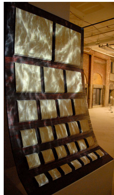
Figure 4. Torrent

that of the turbulent video patterns projected on the squares. Acconci argued that “the screen might be seen as some kind of distorting, inside-out mirror...” (Acconci 126). As in Cascade , the video for Torrent in combination with the inanimate physical creates a new, animated art object, but it may also intimate what lies underneath the veneer surface as Acconci’s inside-out mirror. The projected image is reminiscent